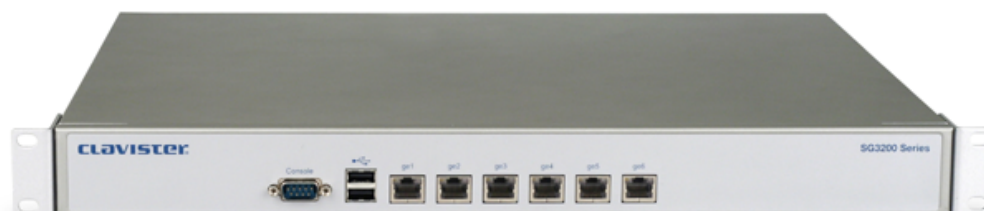
Figure 1.1. Front view of the Clavister SG3200 Series.

The SG3200 features a number of connection ports: