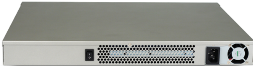
Figure 2.1. SG3200 Rear View

This section describes connecting power to the SG3200. Power should not actually be switched on using the On/Off switch until after the local console has been connected as described in Section 3.1.2, “Connecting the Console Port”. The reason for this is that as soon as power is applied the boot-up dialog sequence will appear on the console screen.